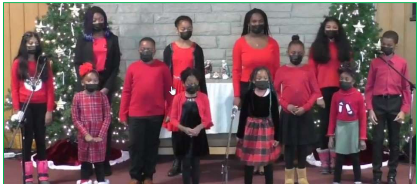
Children and Youth performing the Christmas Musical – 'Good News Ahead'

Our children continued to play a role in our Sunday Services on the fourth Sunday of each month. They also participated in many special services throughout the year such as Palm Sunday, Mother's Day and Father's Day. The biggest highlight was the Christmas Musical put on by the children and youth. We were fewer in numbers, but they still were able to perform a