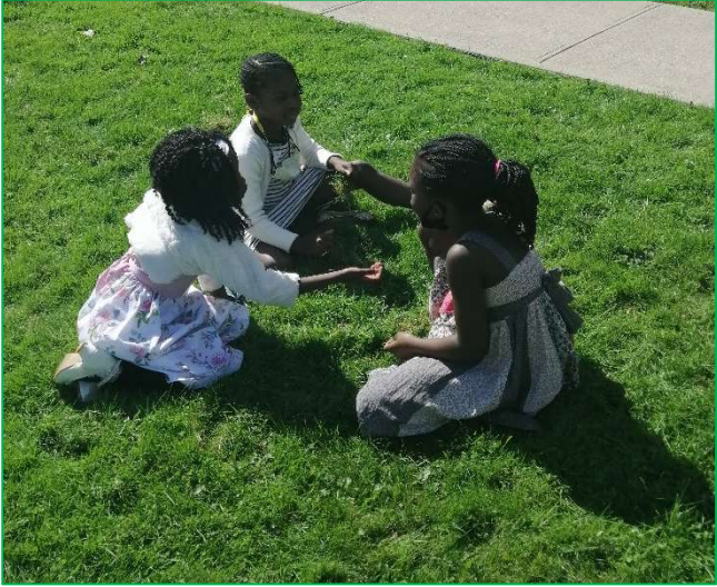
Kids enjoy our first fellowship time in September.