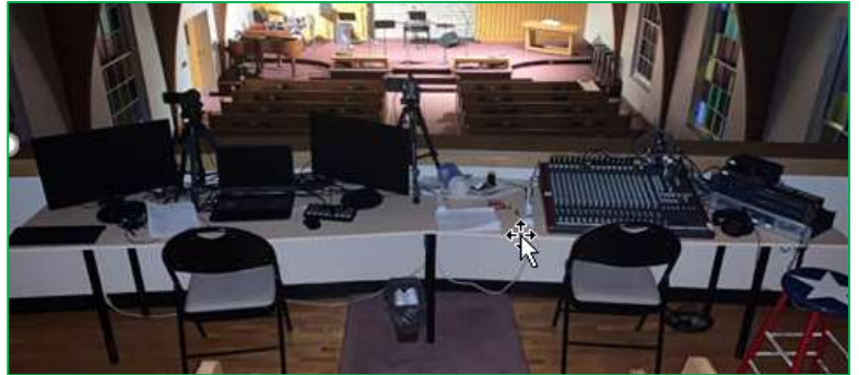
New media center in the balcony for sound & streaming