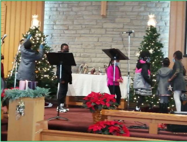
Kids hanging ornaments on Christmas trees.