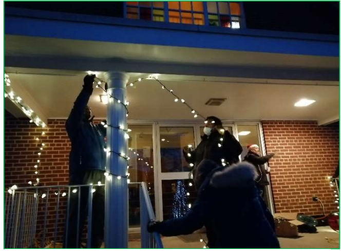
Putting up Lights in preparation for Advent.