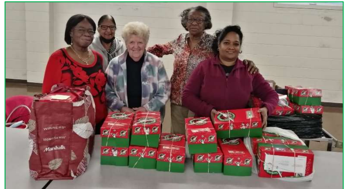
Ladies preparing boxes for Operation Christmas Child